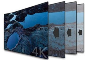
4K Decoding and Display