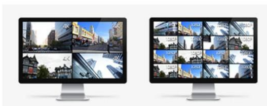
Dual Screen Display & Super Decoding