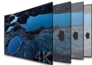
4K Decoding and Display